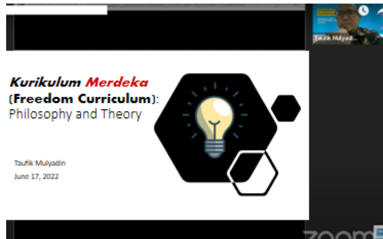
Figure 2. The first speaker giving a lecture on philosophy and theories within Kurikulum Merdeka

curriculum. Regarding practices, the participants were exposed with the effective ways to prepare, perform, and assess the curriculum implementation. Also, the speaker gave a number of examples of learning activities which were in line with Kurikulum Merdeka .