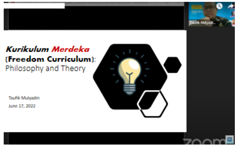
Figure 2. The first speaker giving a lecture on philosophy and theories within Kurikulum Merdeka

curriculum. Regarding practices, the participants were exposed with the effective ways to prepare, perform, and assess the curriculum implementation. Also, the speaker gave a number of examples of learning activities which were in line with Kurikulum Merdeka .