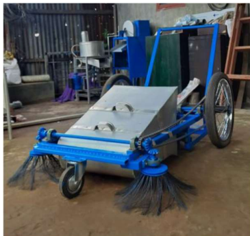
Figure 4. Final result

Creating a steering broom drive system, with two directional brooms located at the front of the machine which can direct the waste to the center in the corners of the room or the corners of the walls. By rotating the two brooms in opposite directions, you can direct the waste to the middle of the machine.