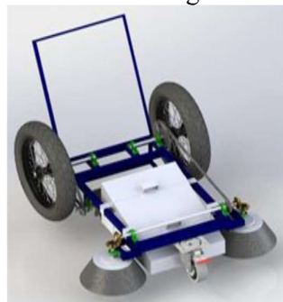
Figure 2. 3D design

Prepare your computer, this image is a tool for designing well using the Solidwork application. The results of the design of all parts using solidwork, starting from the main frame, tires, waste storage tank, and the drive system for the road sweeper.