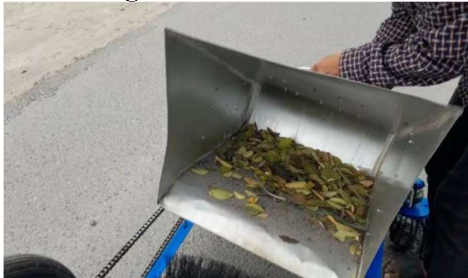
Figure 5. Test results

After testing, it turns out that this sweeping machine can optimally pick up all rubbish on a flat surface and its dust, but not large stones.