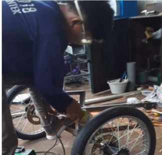
Figure 3. Wheel manufacturing

Making the wheels, my rear wheels use wheels measuring 17 in circumference which are connected to the machine body using an iron axle, while the wheels on the front of my machine use a single wheel which can rotate 360 degrees.